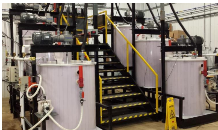
Search Water Leach Pilot Plant at SGS

Search Minerals completed a successful $1.9M pilot plant operation in June 2017 using the proprietary Direct Extraction Process at SGS Canada (Lakefield) (" SGS ") Lakefield, Ontario. The pilot plant provided Search with a sample of a 99% high purity mixed rare earth oxide concentrate ("REO Concentrate") for further testing at separation facilities. The Company has been in continued discussion with various separation refineries whom have either tested the material or reviewed the technical information from the pilot plant. The funding of the pilot plant was provided by $750,000 from the Newfoundland and Labrador Department of Tourism, Culture, Industry and Innovation (" TCII ") and $500,000 from the Atlantic Canada Opportunities Agency (" ACOA ").